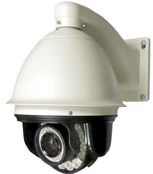
432X Zoom IR Day/Nite PTZ