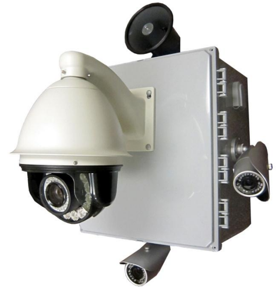
C-WATCH 300 with 3 IR Fixed & 1 432 X Zoom IR PTZ